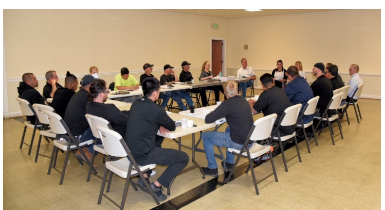
Stertil-Koni heavy duty vehicle lift distributor Alan Tye & Associates focuses on ongoing training for its service technicians and support team